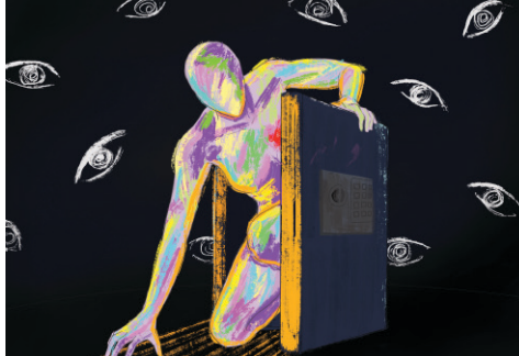
Hide or Shine